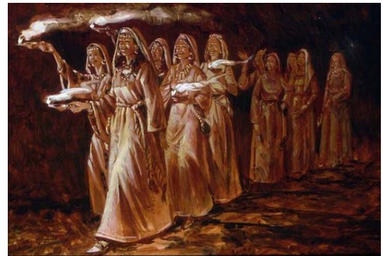
32 nd Sunday in Ordinary Time November 12, 2017

If you or a family member is in the hospital and you would like the priest at Our Lady of the Assumption to contact you, please phone the office.