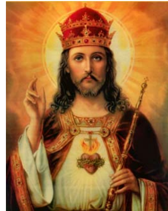
Christ the King November 25, 2018

If you or a family member is in the hospital and you would like the priest at Our Lady of the Assumption to contact you, please phone the office.