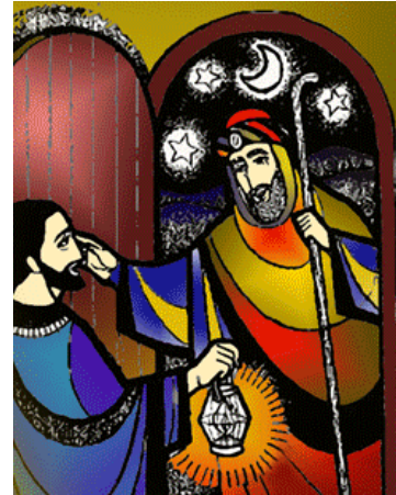
19 th Sunday in Ordinary Time August 11, 2019

If you or a family member is in the hospital and you would like the priest at Our Lady of the Assumption to contact you, please phone the office.